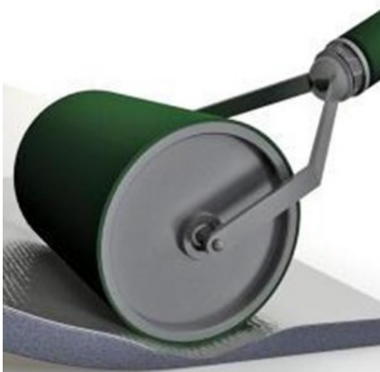
Thicker PSA products are best rolled (See 3.)

Please contact Pyrotek® for further information or detailed advice on your specific application.